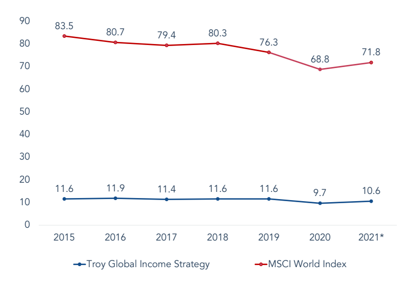
FIGURE 2 - CARBON FOOTPRINT OF CURRENT EQUITY HOLDINGS (TCO2E/ US$M INVESTED)

Our exposure to high-impact sectors, i.e., those with a higher carbon footprint, remains limited given our bias towards capital-light and noncyclical businesses. The Strategy has a carbon footprint 85% lower than the MSCI World Index, see Figure 2. This goes some way in managing the portfolio's exposures to carbon-risk. However, we remain mindful of the fact that all businesses have a role to play in the transition that lies ahead. All but three companies in the portfolio have set a net zero target, and we have a constructive engagement underway with CME Group, Texas Instruments and Nintendo, the three companies that are yet to set a net zero target.